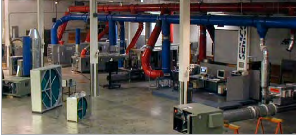
Photo of SEMCO's Air Test Laboratory.

contaminant transfer. The report concluded that the level of indoor building pollutants was between 30% and 50% greater when the wheel that allowed contaminant transfer was used.