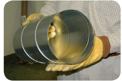
FIGURE 1. Inspect the product

Carefully inspect to make sure that all ends are round (See Figure 1 ) and have not been damaged in shipment or handling.