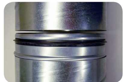
FIGURE 3. Aligned for assembly

Ensure gasket is in its groove approximately ½" from end of fitting. Orient the fitting in the position required for installation. The illustration to the right and the image (See Figure 3 ) show gasketed fitting aligned for assembly.