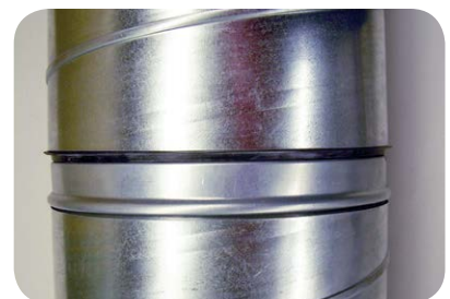
FIGURE 4. Gasket will lay back in place

Do not use of any type of oil to lubricate the gasket.