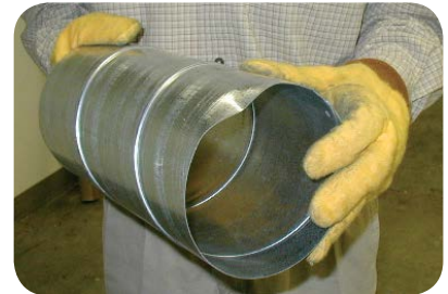
FIGURE 2. Straighten edges

Some minor deformation can occur during the shipping and handling process (See Figure 2 ). This minor deformation can be corrected in the field. It is important that the round shape of both spiral duct and fitting ends be maintained to ensure the proper sealing of the gasket ring. Check the spiral duct ends and remove any burrs and/or other sharp edges to avoid cutting the gasket ring.