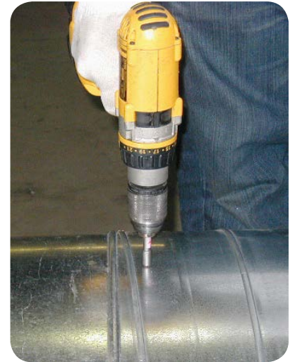
FIGURE 6. Mechanically fasten

Recommended tek screw size is #10 x 3/4, zinc plate. Note that even spacing of fasteners will equalize pressure on the gasket seal.